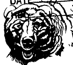
EXHIBIT 2 DATE 3/21/95 SB 389

P. O. Box 200701 Helena, MT 59620-0701 (406) 444-2452 FAX: 406-444-4952