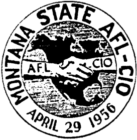
EXHIBIT 2 DATE 4-9-91 SSJ 26