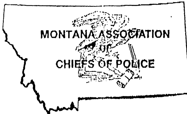
EXHIBIT 2 DATE 3/14/91 HB 100