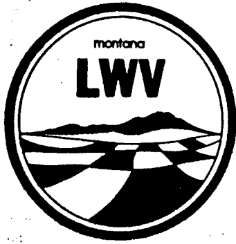
Exhibit "4" HB-257 3-12-85