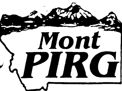
Exhibit "1" HB-257 3-12-85

729 Keith Avenue • Missoula, MT. 59801 • (406) 721-6040