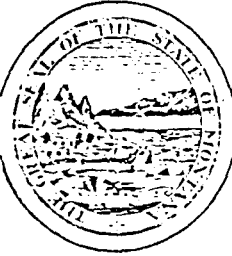
Exhibit 2 3-8-85 HB 927 Bergene