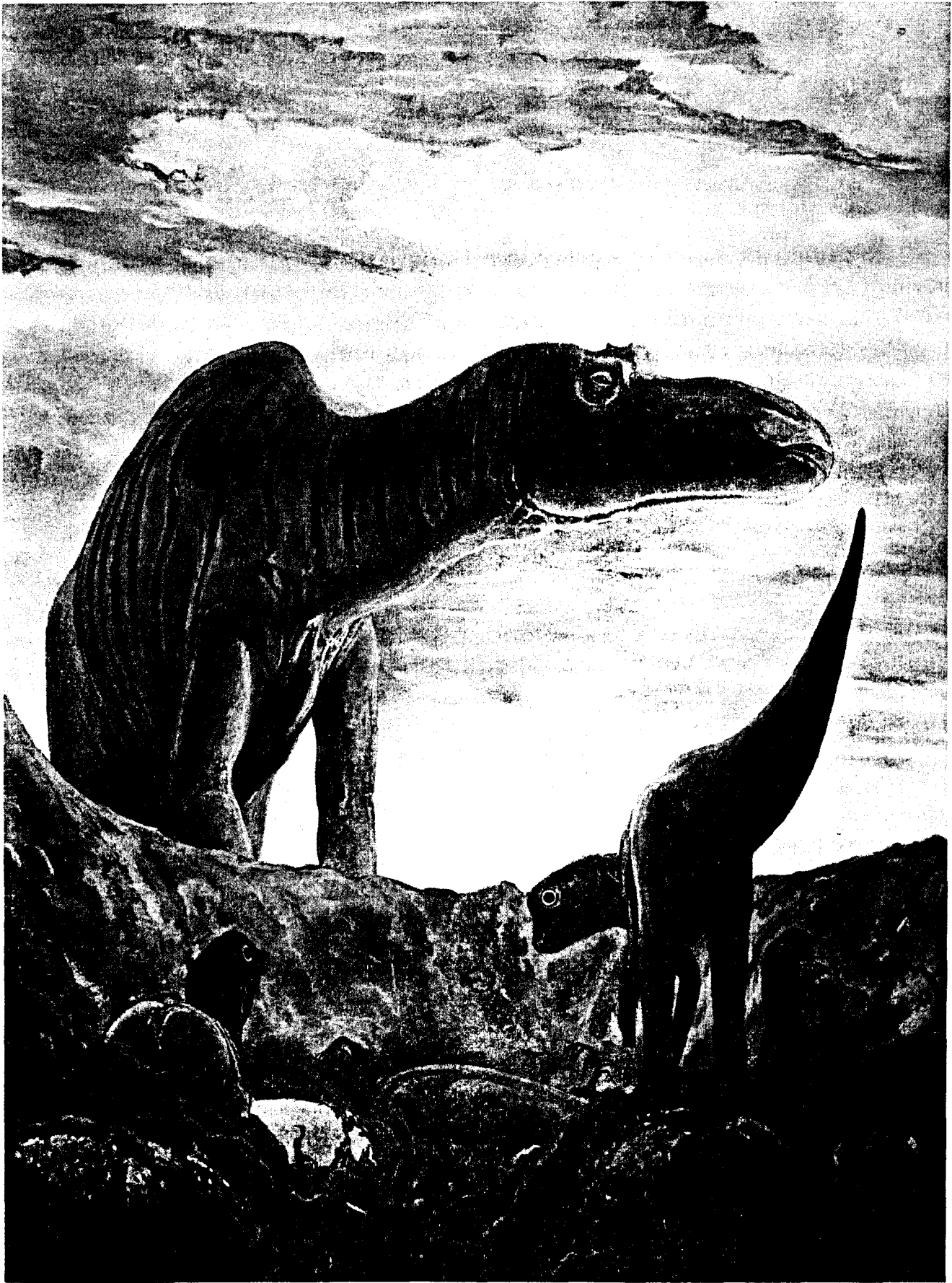
MONTANA'S FIRST FAMILY MAIASAURA PEEBLESORUM (MAY-AH-SAWR-A)