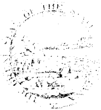
EXHIBIT 1 (a) State Admin 4/20/83