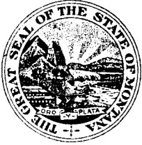
Exhibit A 1-28-83