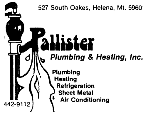
Exhibit #6 1/10/83