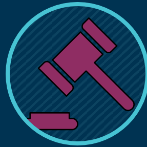
Rules Regarding Mandatory Use and Uniformity