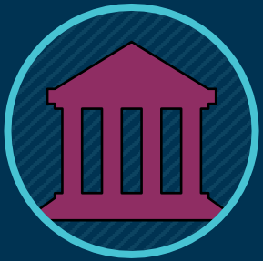
Rules for Withdrawal of Attorneys