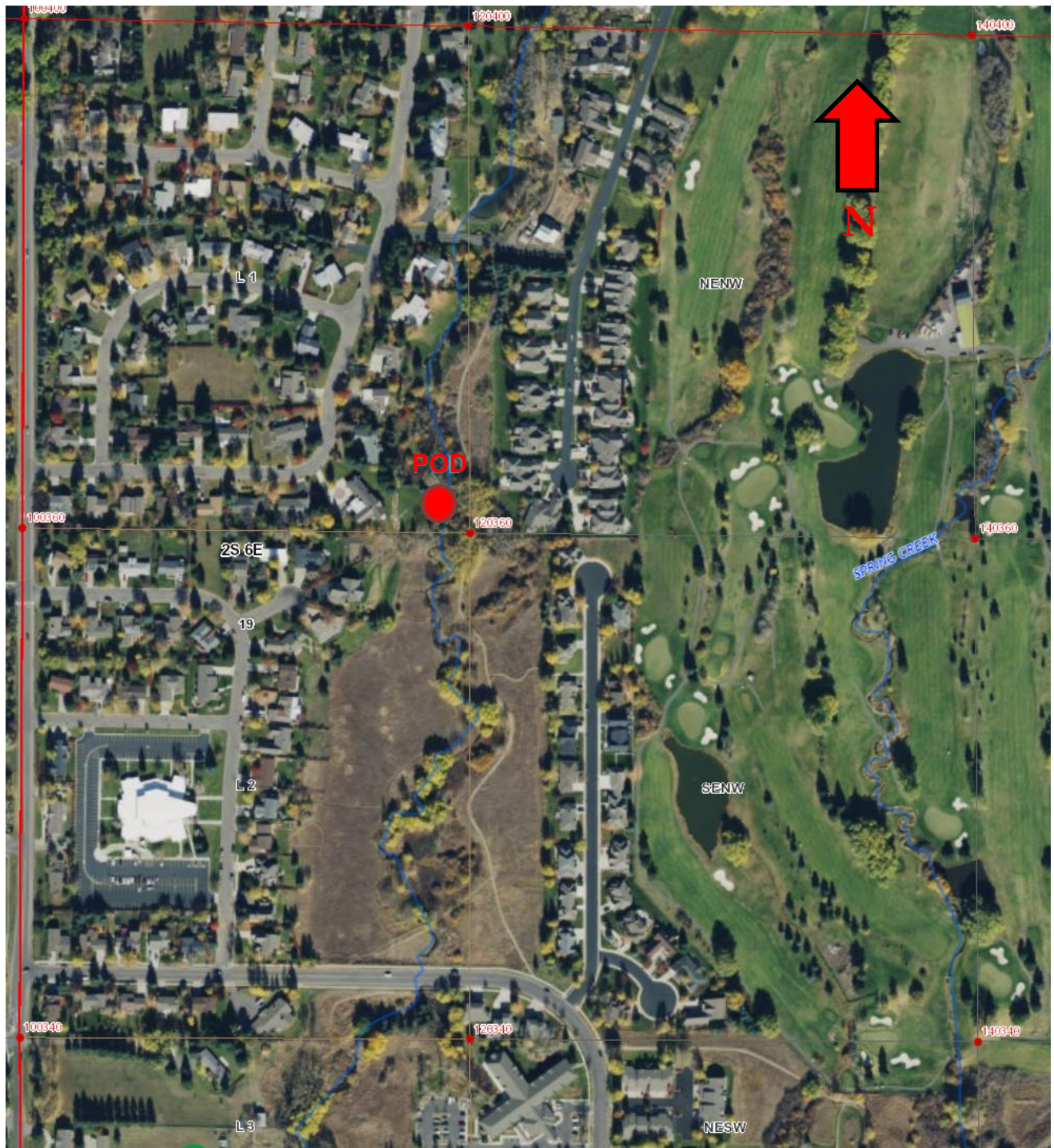
Figure 1. POD located in the SENWNW of section 19, Township 2 S Range 6E, Gallatin County for water for water right 41H 140999-00.