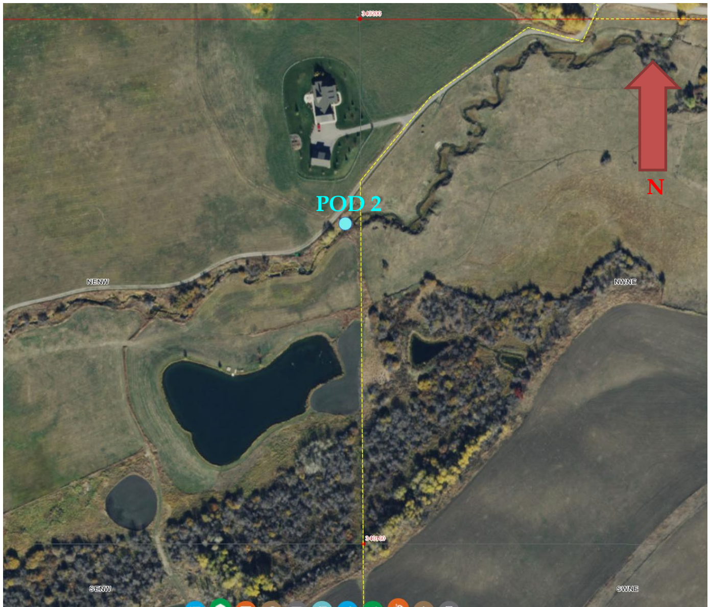
Figure 3. Clarified 41H 140950-00 POD 2 in the NENENW of Section 33, Township 3 North, Range 5 East, Gallatin County